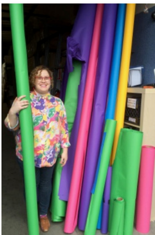
An elementary school art teacher picks up high quality seamless paper leftover from a photo shoot in LA.