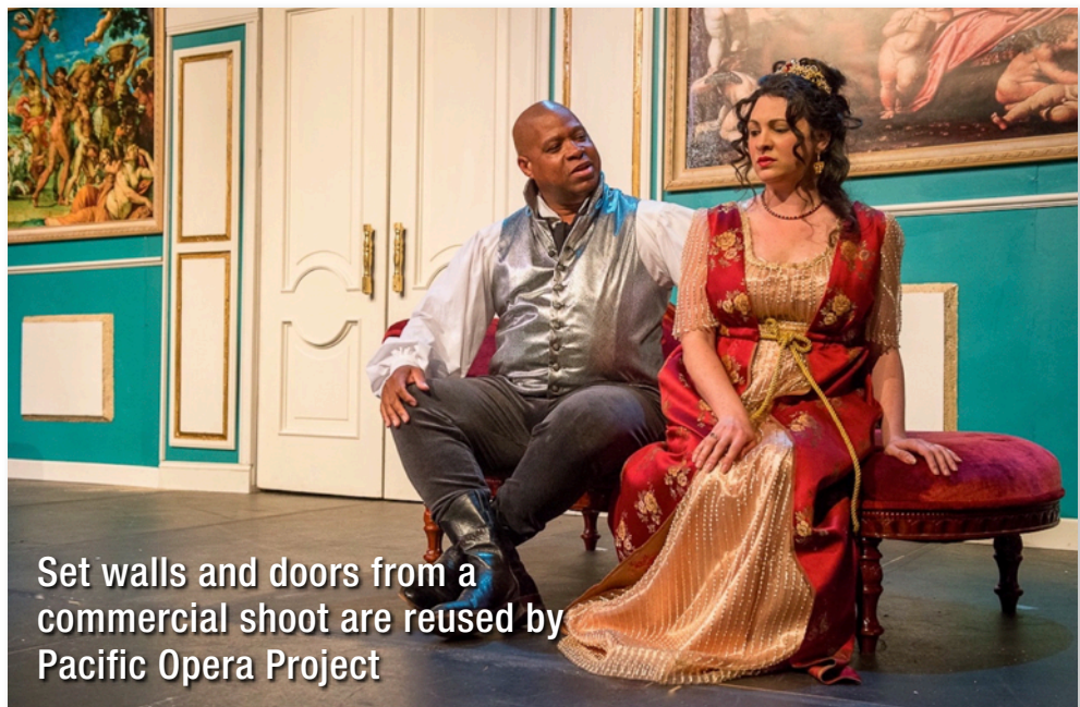
Set walls and doors from a commercial shoot are reused by Pacific Opera Project