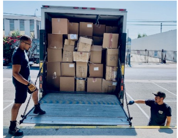
EcoSet can pick up or receive Set Dec and props during strikes or storage clear outs