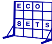
Standard Flat Rentals