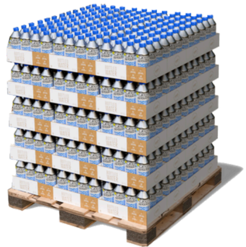
FULL PALLET $1,944/pallet, $32.40/case (60 cases @ $1.35 per bottle)