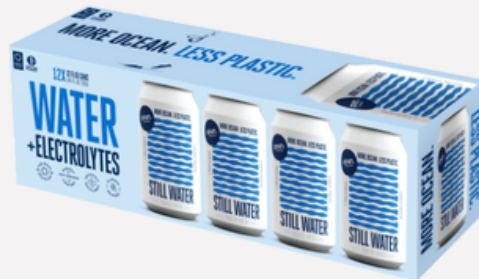
12-PACK CASE $15.00/case ($1.25 per can)