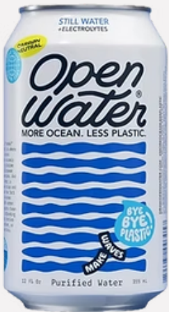
12oz Flip Top Cans