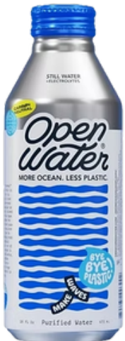
16oz Twist Top Bottles