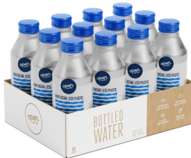
24-PACK CASE $38.40/case ($1.60 per bottle)