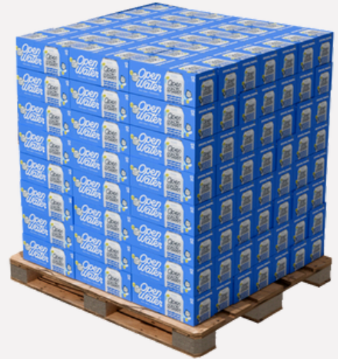
FULL PALLET $2,160/pallet, $12.00/case (180 cases @ $1.00 per can)