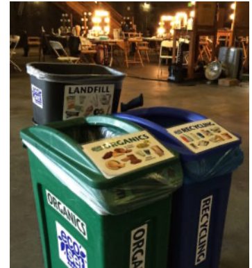
EcoSet provides up to 20 custom Zero Waste Stations to collect recyclables, food waste and landfill materials

Eco Crew Call Time: 30 min prior to breakfast Ready to Serve (RTS) EcoSet Wrap Time: Last team out unless released by Production Team, Art Department and Location Manager